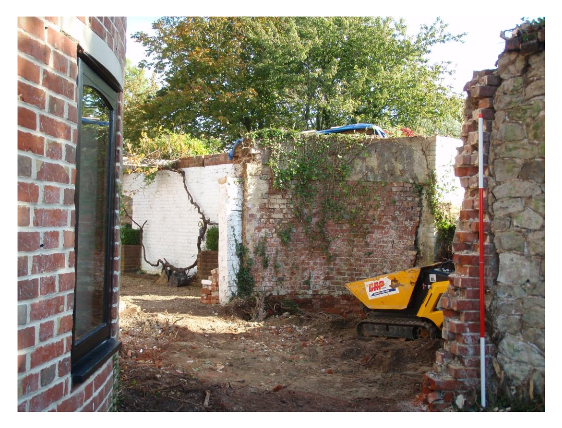
Plate 7. Removing modern floor surfaces (looking S)