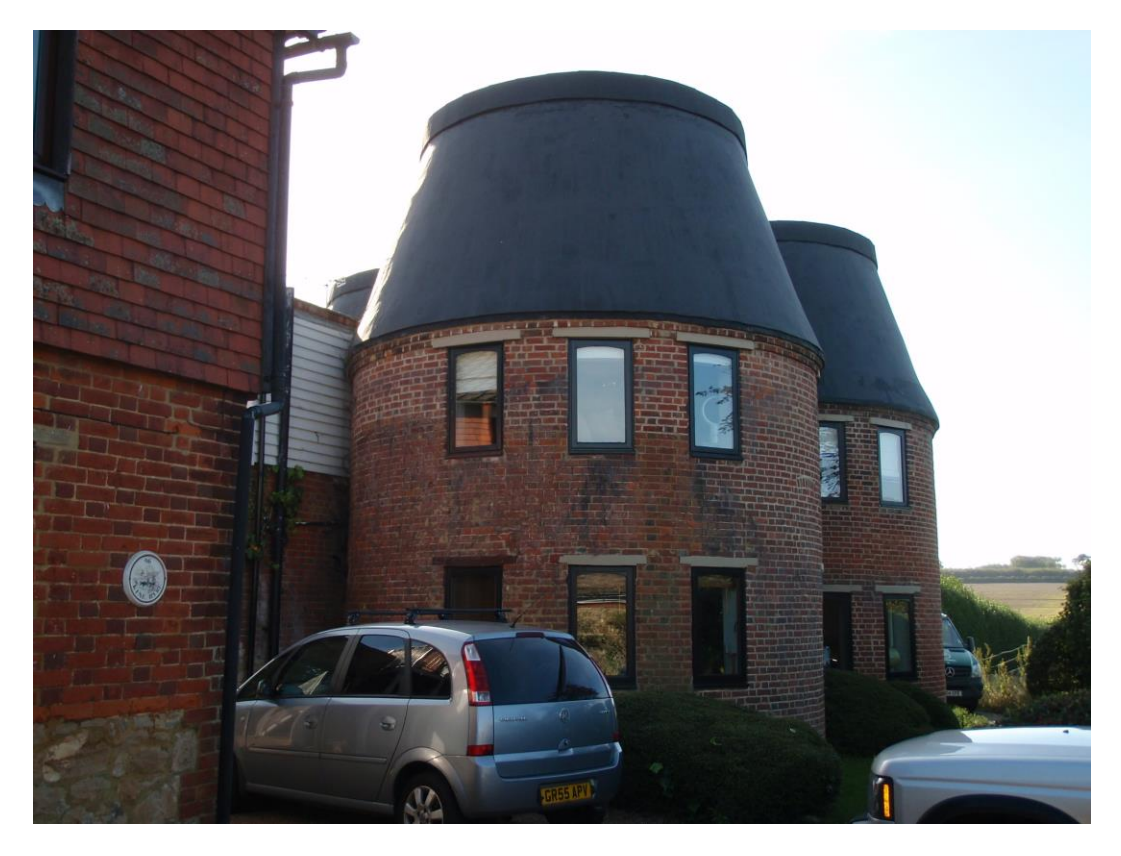
Plate 2. View of the site (looking NNE)