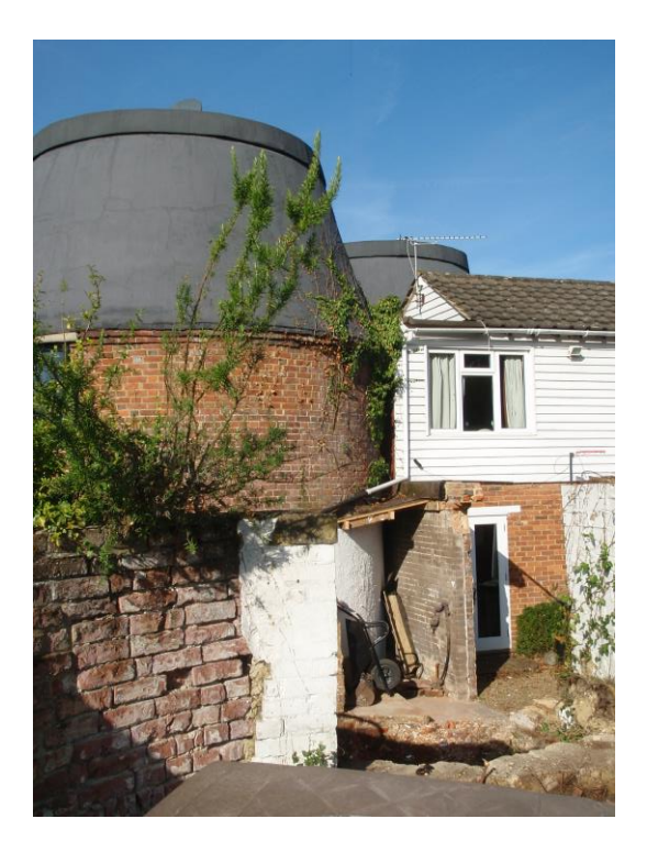
Plate 5. Demolition of modern structure (looking W)