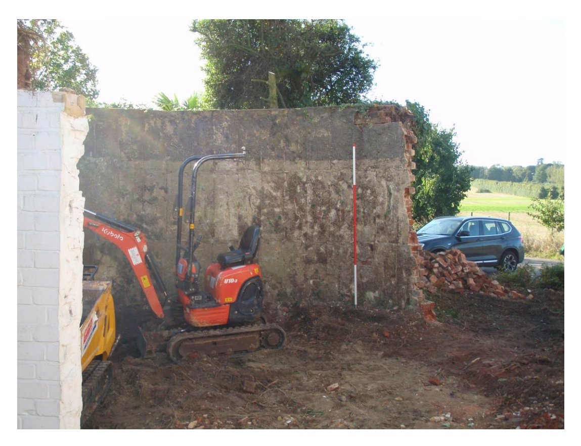
Plate 6. Removing modern floor surfaces (looking S)