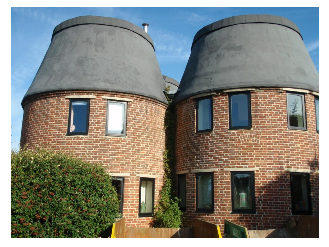
Plate 3. View of the site (looking N)