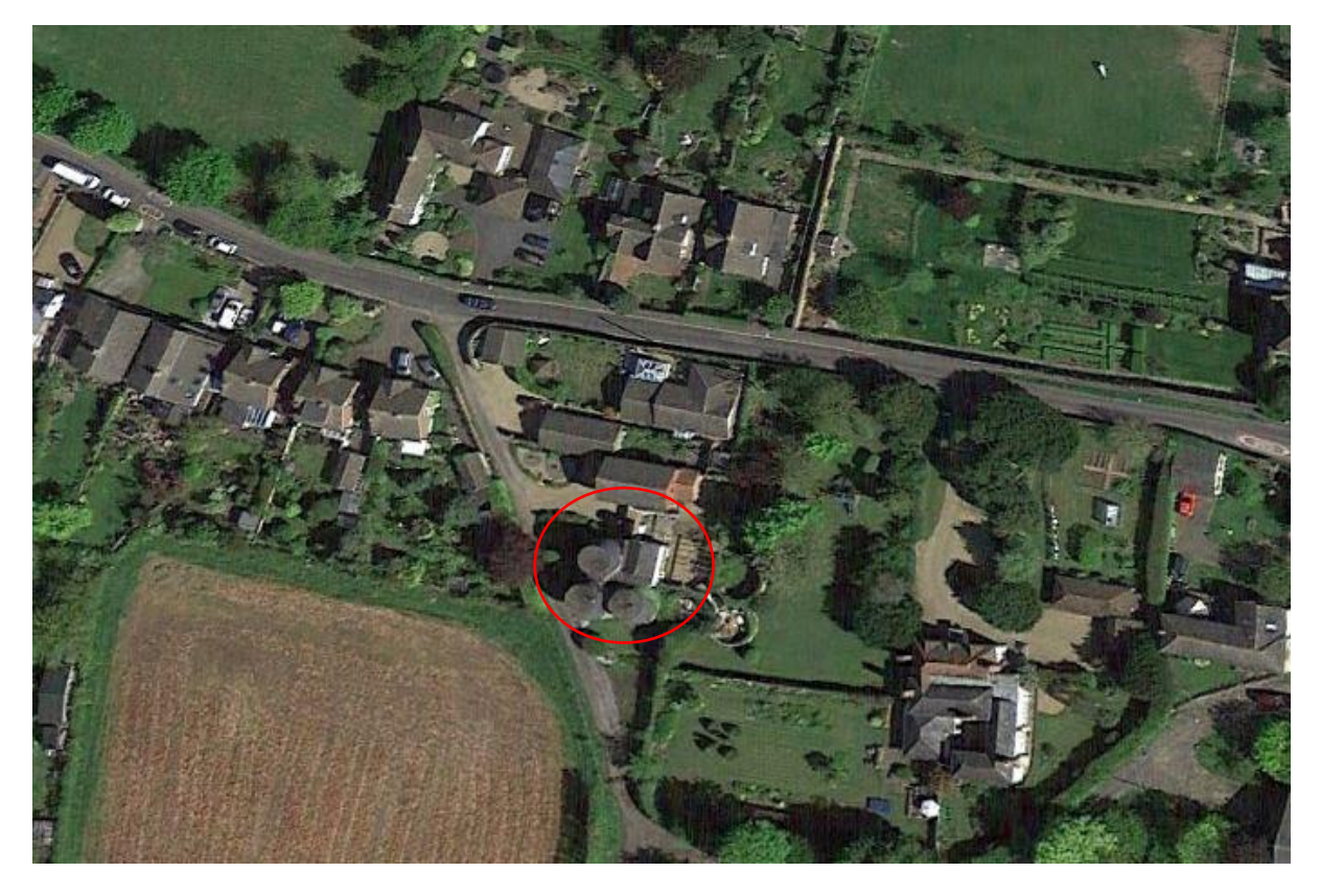
AP 1. View of proposed development area (2017)