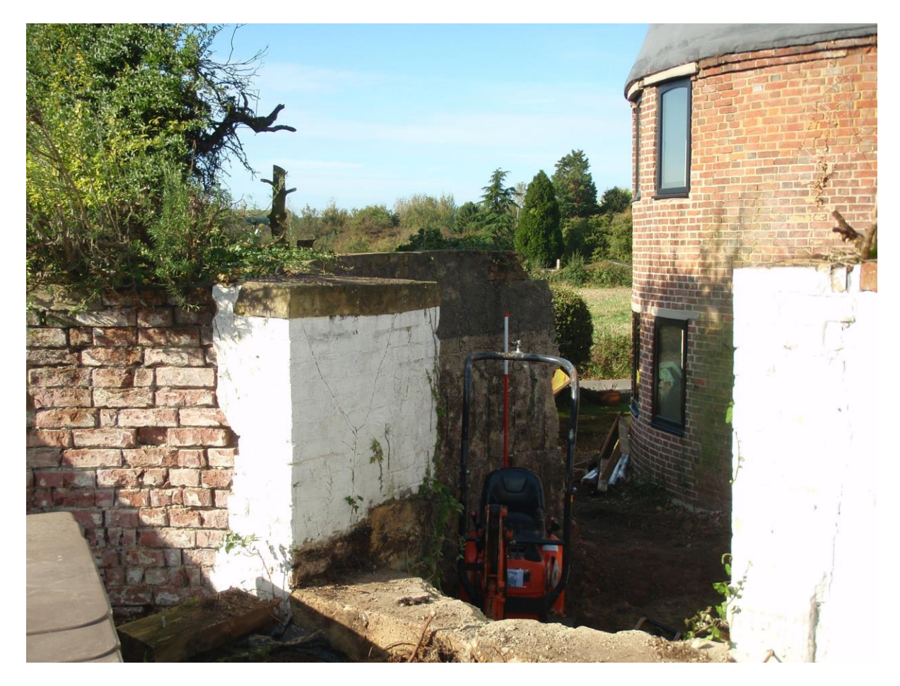
Plate 4. Demolition of modern structure (looking SW)